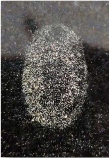
Figure 1: Development of Latent Fingerprint with the help of Asafoetida powder on a Non-Porous marble surface