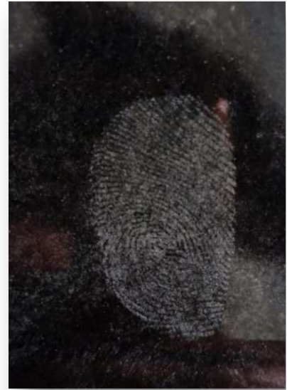
Figure 3: Development of Latent Fingerprint using Beetroot powder on Non Porous marble surface