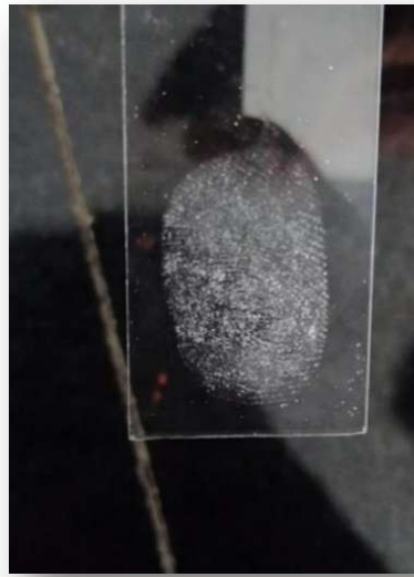
Figure 5: Development of Latent Fingerprint with the help of Neem powder on a porous marble surface.