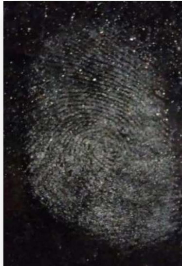
Figure 2: Development of Latent Fingerprint using Fenugreek powder on Non Porous marble surface