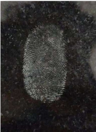
Figure 4: Development of Latent Fingerprint with the help of Banana powder on a porous marble surface