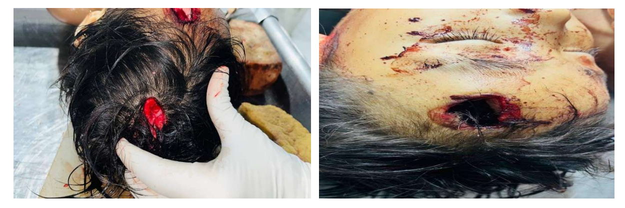
Figure 2. Depressed open comminuted fractures of skull bones Figure 3. Lacerated wound of the scalp over the left frontal region

Figure 1. Showing blood stained kitchen knife and hammer