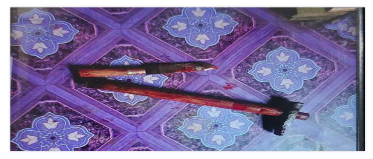
Figure 1. Showing blood stained kitchen knife and hammer